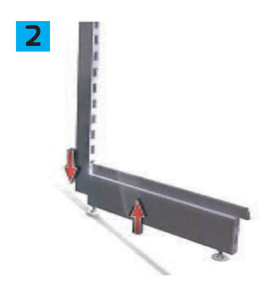
Using a rubber mallet, firmly knock the baseleg upwards locking it into position until flush.