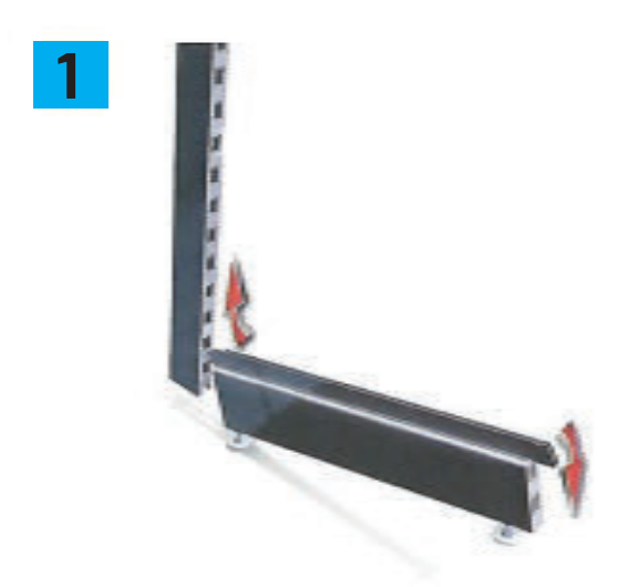
Locate the baseleg rear lug and block into the bottom "H" Slots of the upright as shown.