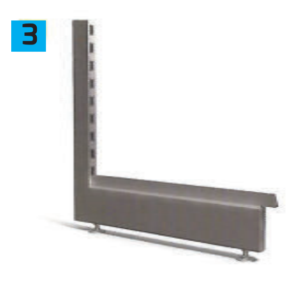
Repeat steps 1 and 2 until you have two "L" shaped uprights.