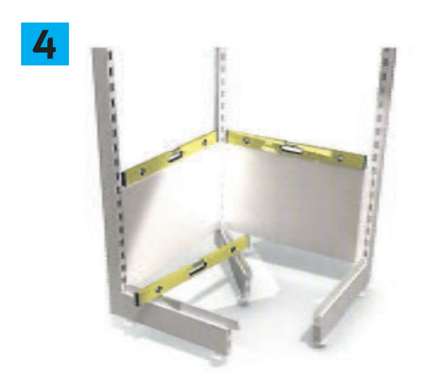
Connect all "L" shaped uprights together by fitting 665mm back panels into the bottom "H Slots" of both left and right hand side uprights to the central upright. Now check levels are correct by adjusting the foot discs as required. *