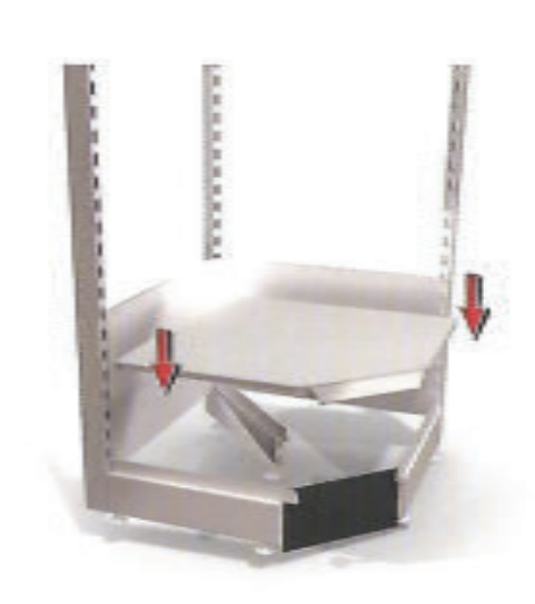
Fit the base shelf onto the baseleg runners. Now fit all remaining back panels.

* Note: Back panel lugs locating into the cetral upright must be sent to a 45 degree angle prior to installation.